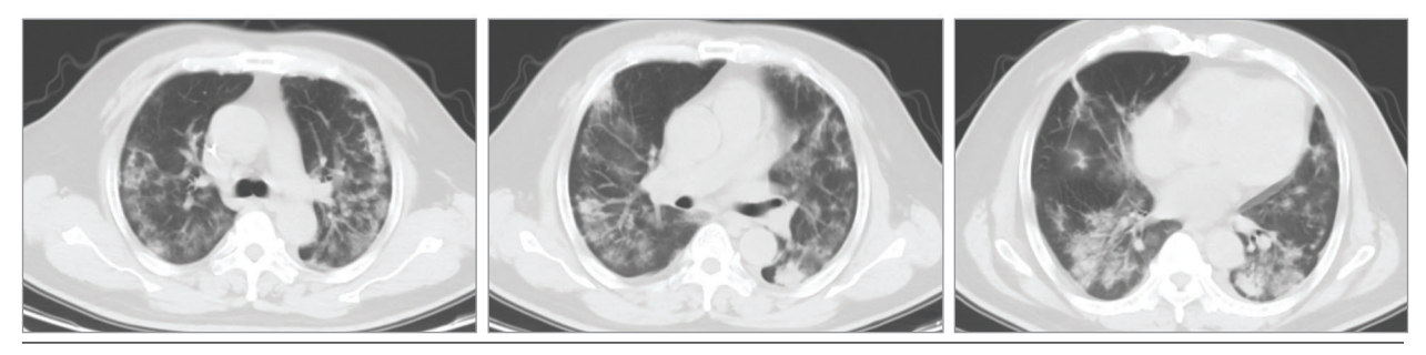
A, Chest computed tomographic images obtained on January 7, 2020, show ground glass opacity in both lungs on day 5 after symptom onset. B, Images taken on January 21, 2020, show the absorption of bilateral ground glass

B Computed tomography images after treatment on day 19 after symptom onset